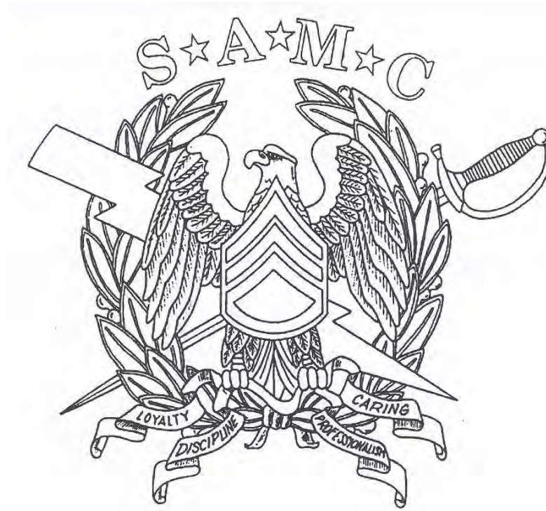
Figure H-1. SAMC Logo and Lineage.

S*A*M*C: Initials separated by three stars which represent the Be, Know, and Do for the NCO.