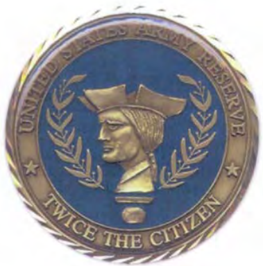
Sergeant Audie Murphy Medallion (Back)