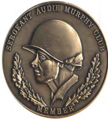
Sergeant Audie Murphy Medallion (Front)